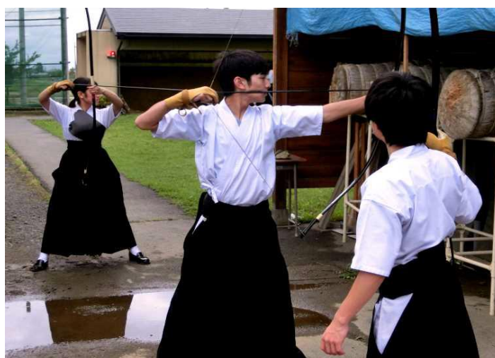
Kyudo (Japanese Archery) Club