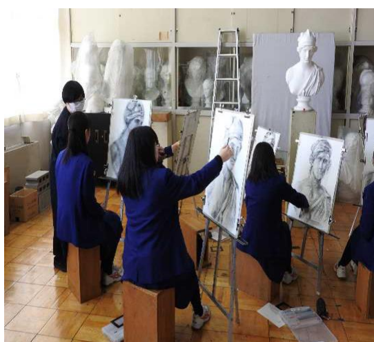
Students of Art Course