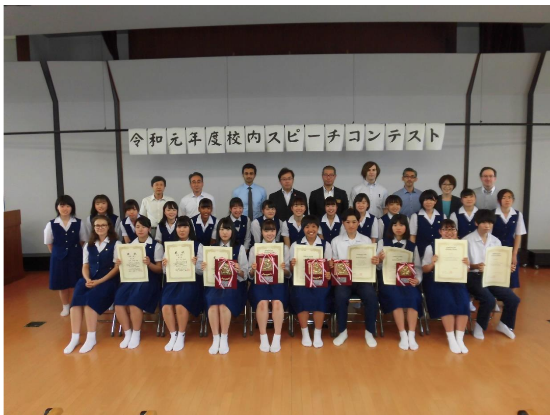
Foreign Language Speech Contest