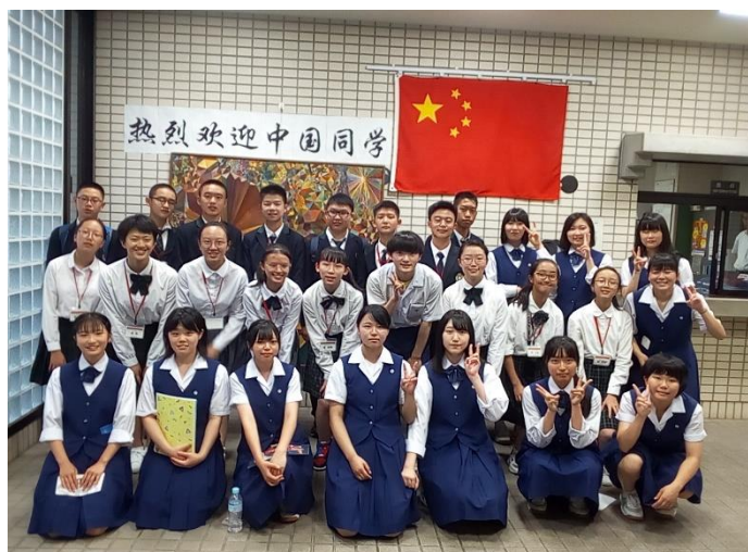
Chinese Students visit Kozukata